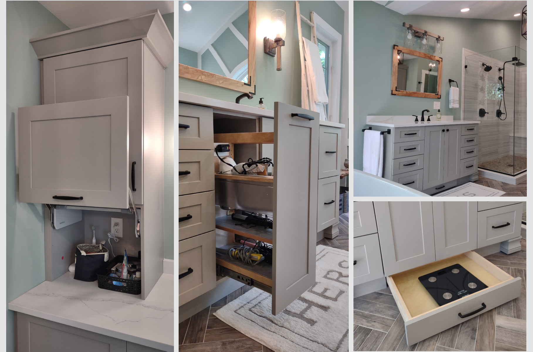
E Bathroom Door Style: Pendleton | Overlay: Full | Species: Paint Grade | Finish: Dorian Gray Designed by 2690 Design in Baltimore, MD.