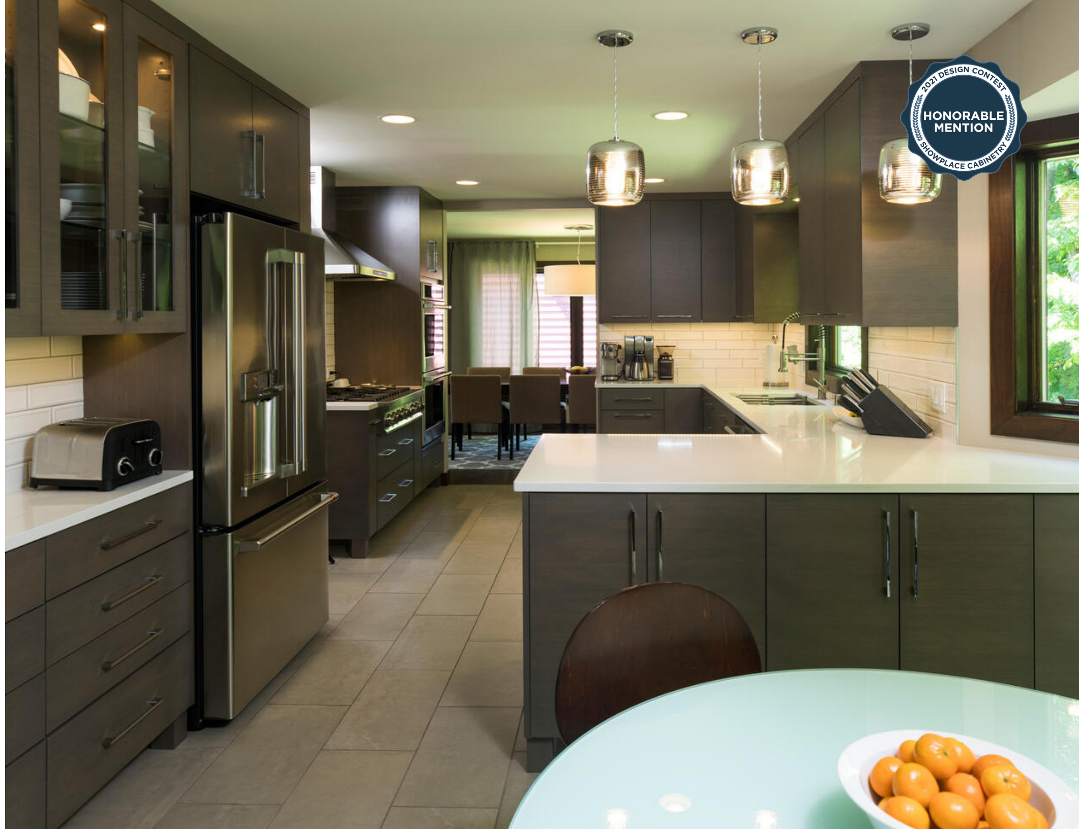
E Kitchen Door Style: Horizon | Overlay: Full | Species: Bamboo | Finish: Rockport Designed by The Cabinet Store in Apple Valley, MN.