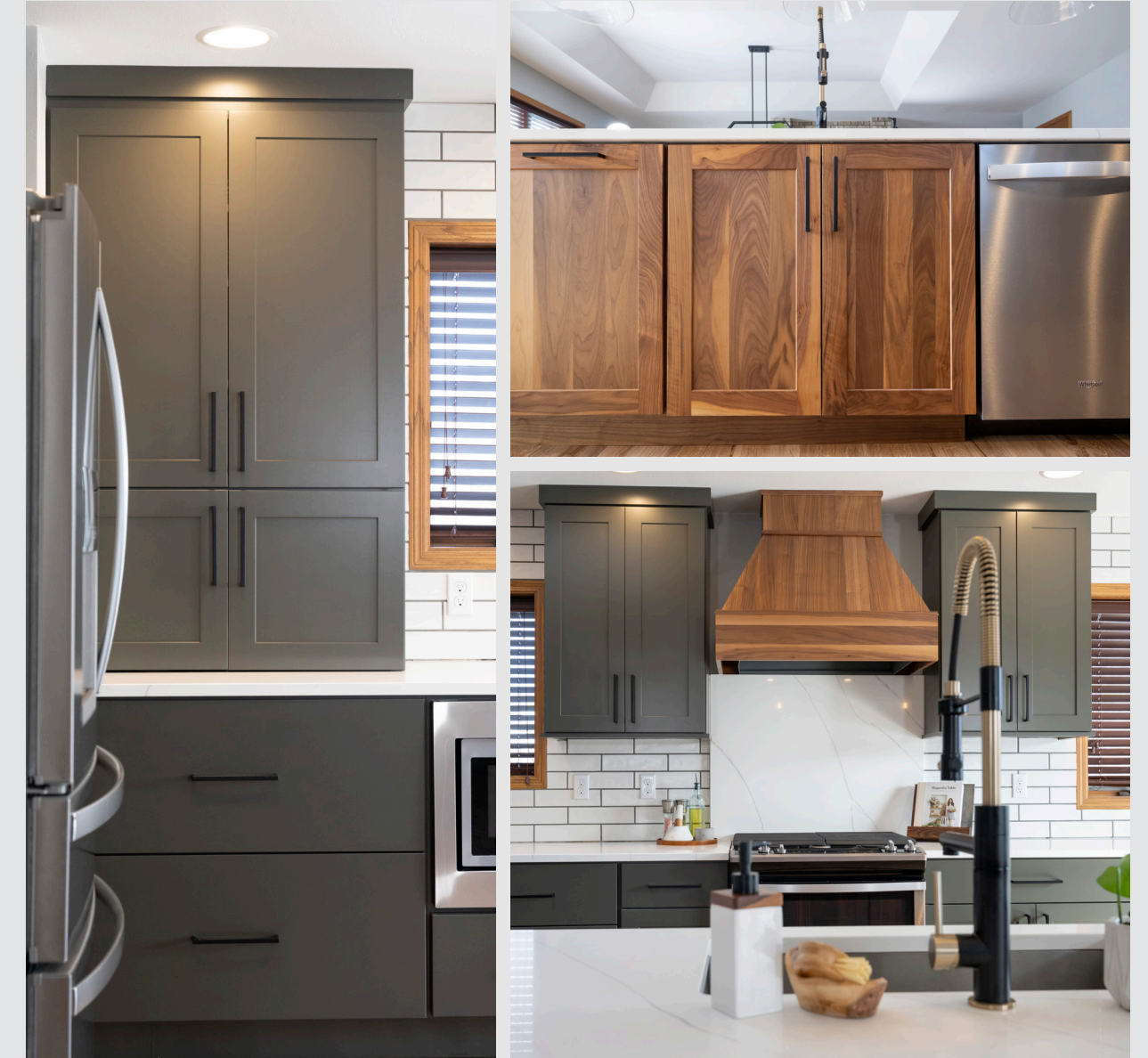
Door Style: Pendleton | Overlay: Full Kitchen Perimeter Species: Paint Grade | Finish: Urbane Bronze Kitchen Island/Hood Species: Walnut | Finish: Natural