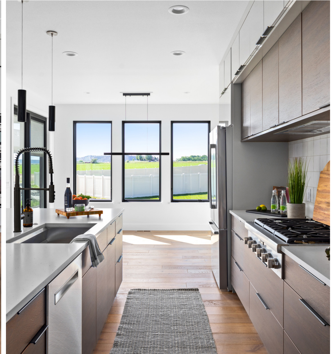
E Primary Kitchen Door Style: Horizon | Overlay: Full | Finish: Textured Melamine Seared Oak Accent Kitchen Door Style: Duet | Overlay: Full | Finish: High-Gloss Acrylic Smoke Designed by Hannesson Home in Billings, MT.