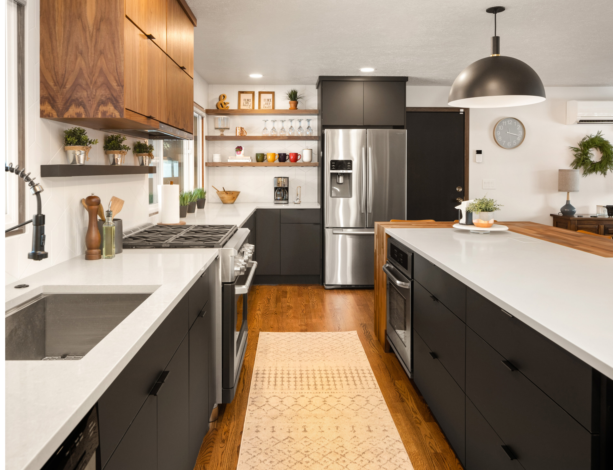
E Door Style: Milan | Overlay: Full Kitchen Perimeter/Island Species: Paint Grade | Finish: Black Kitchen Accent Species: Walnut | Finish: Natural Designed by CraftedD Kitchen Design in Post Falls, ID.