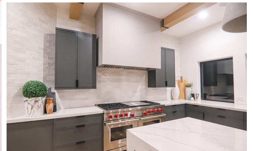
E Kitchen Door Style: Aria | Overlay: Full | Species: Paint Grade | Finish: Graphite Designed by Design Outside the Lines Interiors in Litchfield Park, AZ.