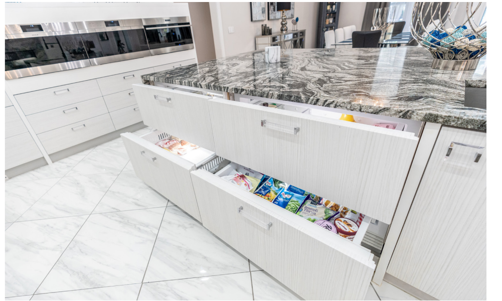
E Door Style: Duet | Overlay: Full Kitchen Base/Island Finish: Foil Oyster Bay Kitchen Wall Finish: High-Gloss Acrylic White Designed by Acme Cabinet Company in Buffalo, NY.