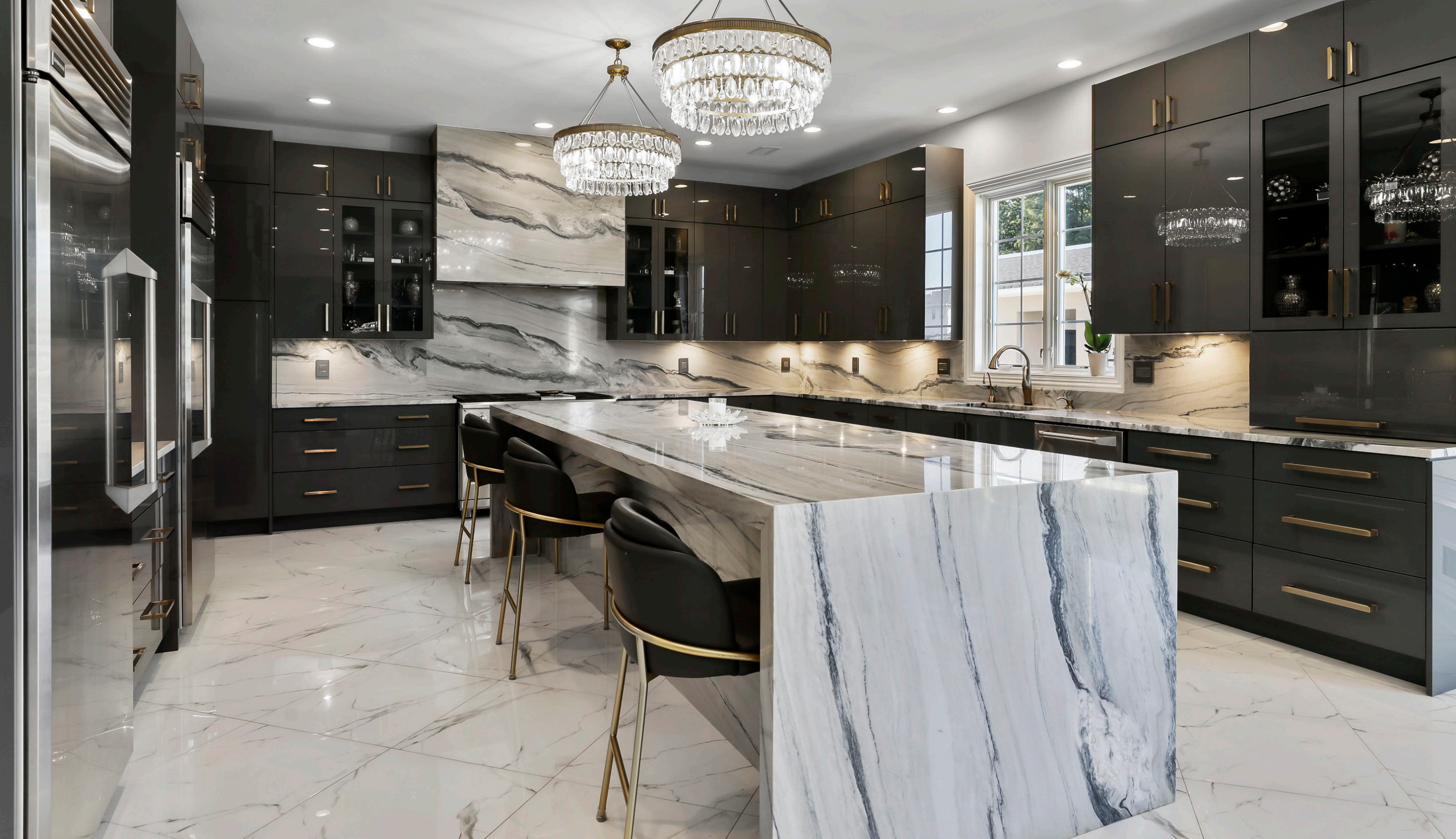
E Primary Door Style: Duet | Overlay: Full | Finish: High-Gloss Acrylic Dark Gray Designed by Amoroso Construction in Freehold, NJ.

Color representations are approximate. Please base selection decisions on actual samples.