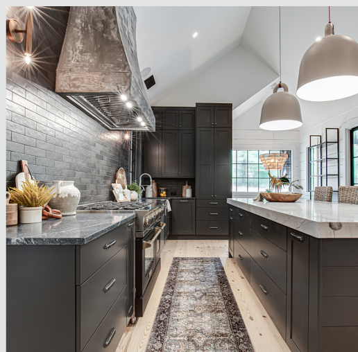
E Kitchen Door Style: Pendleton | Overlay: Full | Species: Paint Grade | Finish: Iron Ore Designed by Haggard Home in Norcross, GA.