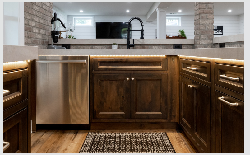
Bar Door Style: Edgewater Inset | Species: Rustic Alder | Finish: Tawny Designed by The Washington Kitchen Gallery in Ijamsville, MD.