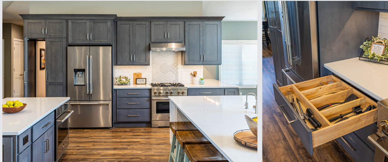
Door Style: Pendleton | Overlay: Partial Kitchen Perimeter/Island 1 Species: Maple | Finish: Thunder Kitchen Island 2 Species: Paint Grade | Finish: Heron Plume Designed by Linclon Cabinet in Linclon, NE.

Color representations are approximate. Please base selection decisions on actual samples.