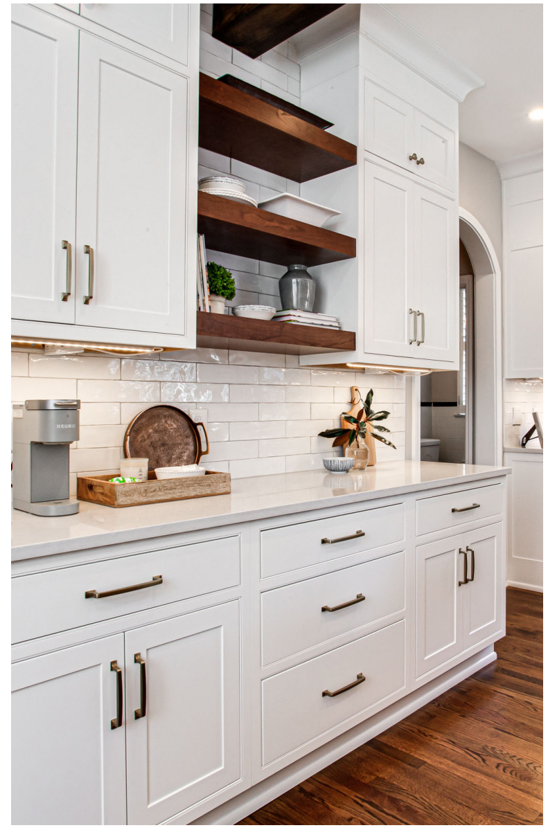
Door Style: Pendleton Inset Kitchen Perimeter/Island Species: Paint Grade | Finish: White Kitchen Hood/Shelves Species: Cherry | Finish: Pecan Designed by Haggard Home in Norcross, GA.